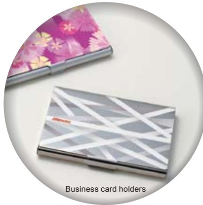
Business card holders